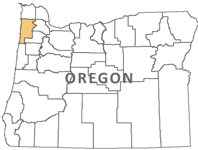
Study Location Map